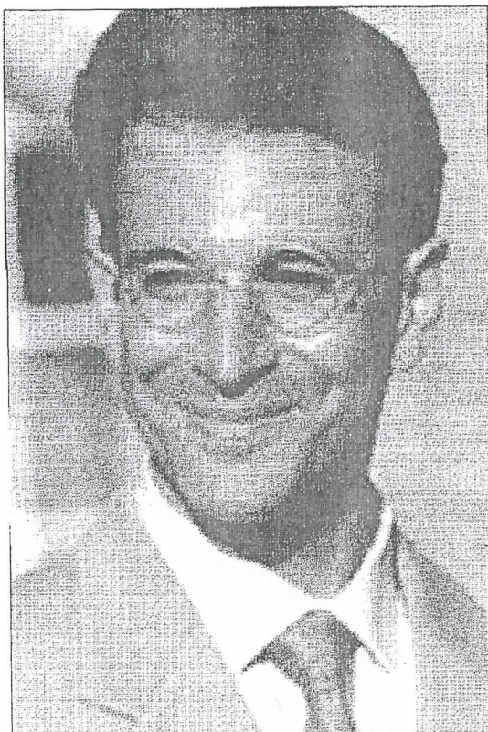
Top, Daniel Pearl photographed in captivity by his captors days before his murder. Above, the tenacious and highly regarded reporter