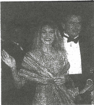
Bernard-Henri Lévy with his wife, Arielle Dombasle, at a film festival in Morocco.

Mr. Lévy was on a diplomatic mission to Afghanistan for President Jacques Chirac when he heard of Mr. Pearl's death. After completing his work in Kabul, he flew immediately to Karachi, returning to Pakistan for the first time since 1971. And in his airport taxi, he already sensed how the country had changed. "What is your religion?" the taxi driver asked him. He was taken aback. "Atheist."