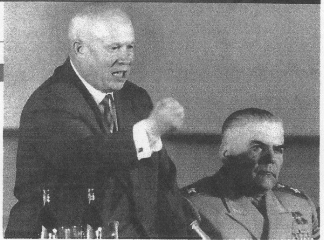
'EVIL EMPIRE': New transcripts shed light on Khrushchev (left)