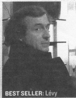
BEST SELLER: Lévy