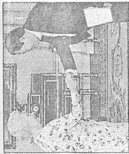
Queen and Ri Yong Ho: carriage wasn't sent to embassy in Ealing