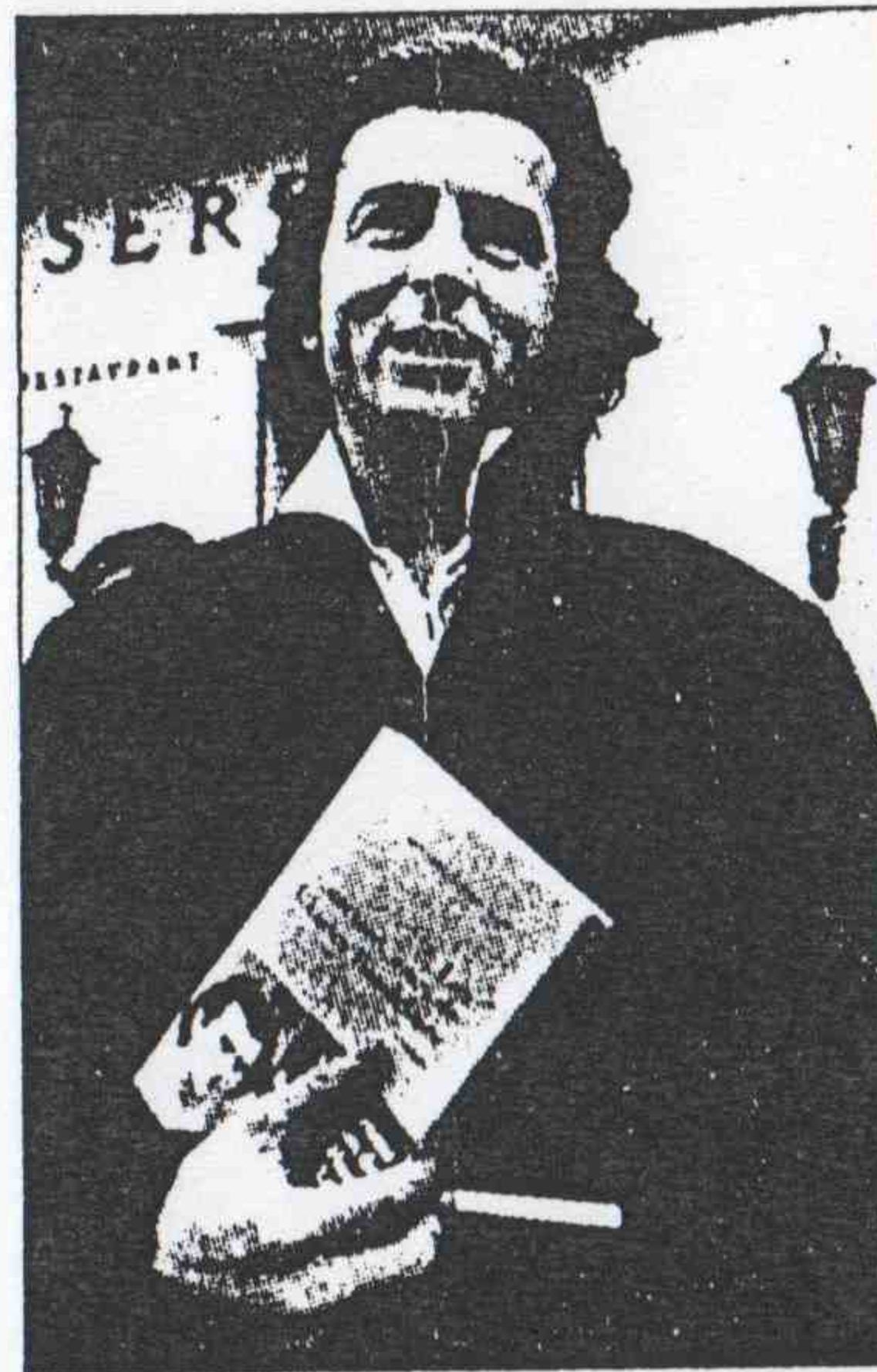
Bernard-Henri Lévy: candid critique from a modern Voltaire

Lévy does indeed diagnose the conditions of the French intellectual as that of a secular priesthood, called upon to arbitrate between ideals such as Truth, Liberty and Justice and the institutions of the State. What he does not seem to see