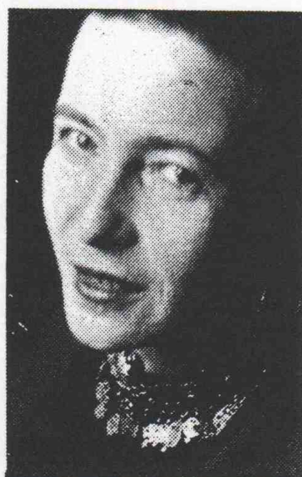
Simone de Beauvoir: accuser

Lévy's narrative is impassioned but not impartial. He selects his materials to suit his story. Which means, in effect, he tells but half the story. Lévy highlights the incidents which compromised French intellectuals but is slow to acknowledge their many feats of courage. Apart from Camus, we hear nothing of those countless French intellectuals who consistently resisted the ideological lure, such as René Char, Vidal Naquet, Emmanuel Levinas or Paul Ricoeur, who never betrayed democracy, who never deemed the morality of human rights redun-