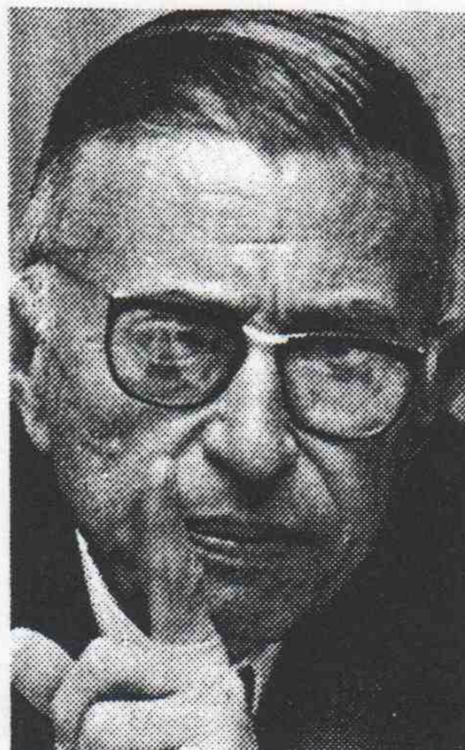
Jean-Paul Sartre: prophet

Despite its good intentions, this new ideology led to its own errors of judgment. Sartre defended the terrorist massacre of the Israeli athletes in the Olympic Village in Munich. Foucault hailed Khomei-